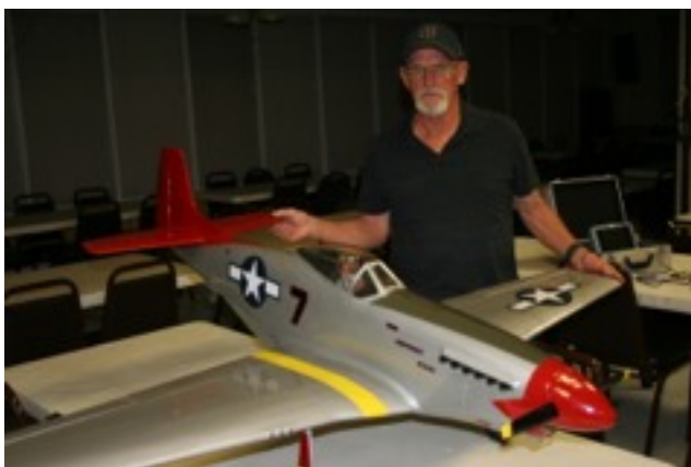
Jim - Topflite Gold edition P-51