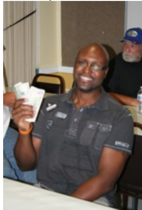
Forest - Cash