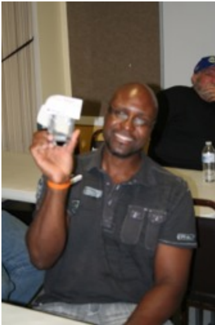
Forest - Motor mount