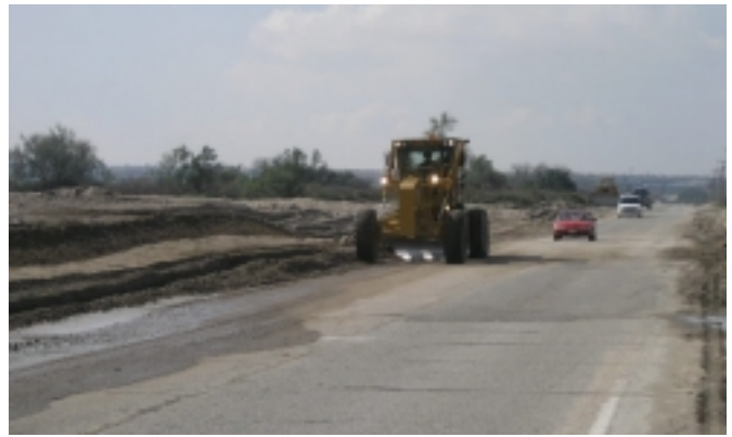
Above: Heavy equipment has cleared the road to Glen Helen. The field is open and in good condition thanks to major cleanup by MARKS volunteers. (photos taken